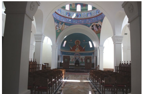
The St. Andrew interior with a temporary Iconostasis. The marble iconostasis was carved in Syria and is on its way by ship to California..