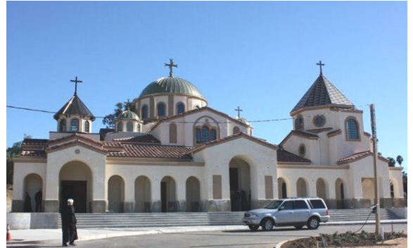
Exterior of St. Andrew Church before the installation of the stone on the walkway and stairs, and the marble wainscoting around the base.