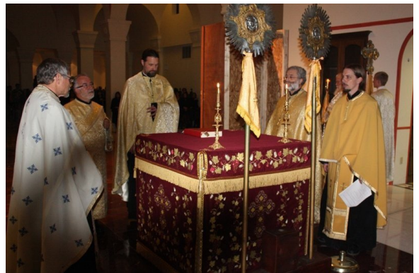
Some of the clergy attending the Liturgical Seminar during Vespers.